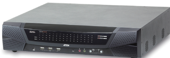
KN8164V Front view